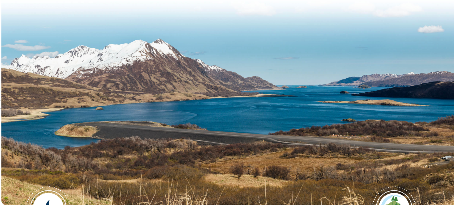
• Kodiak Island's Old Harbor Airport at Midway Bay, AK